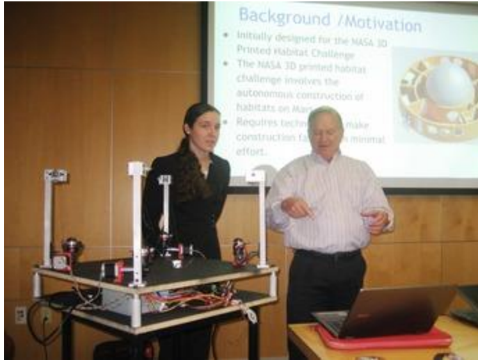
Paul Street shares enthusiasm for the additive technology potential at construction sites